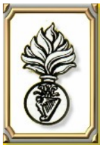
The Royal Irish Fusiliers