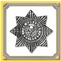
The Cheshire Reg