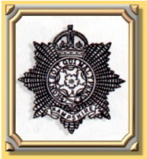
The Hampshire Reg