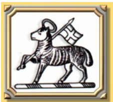
The Royal West Surrey Reg